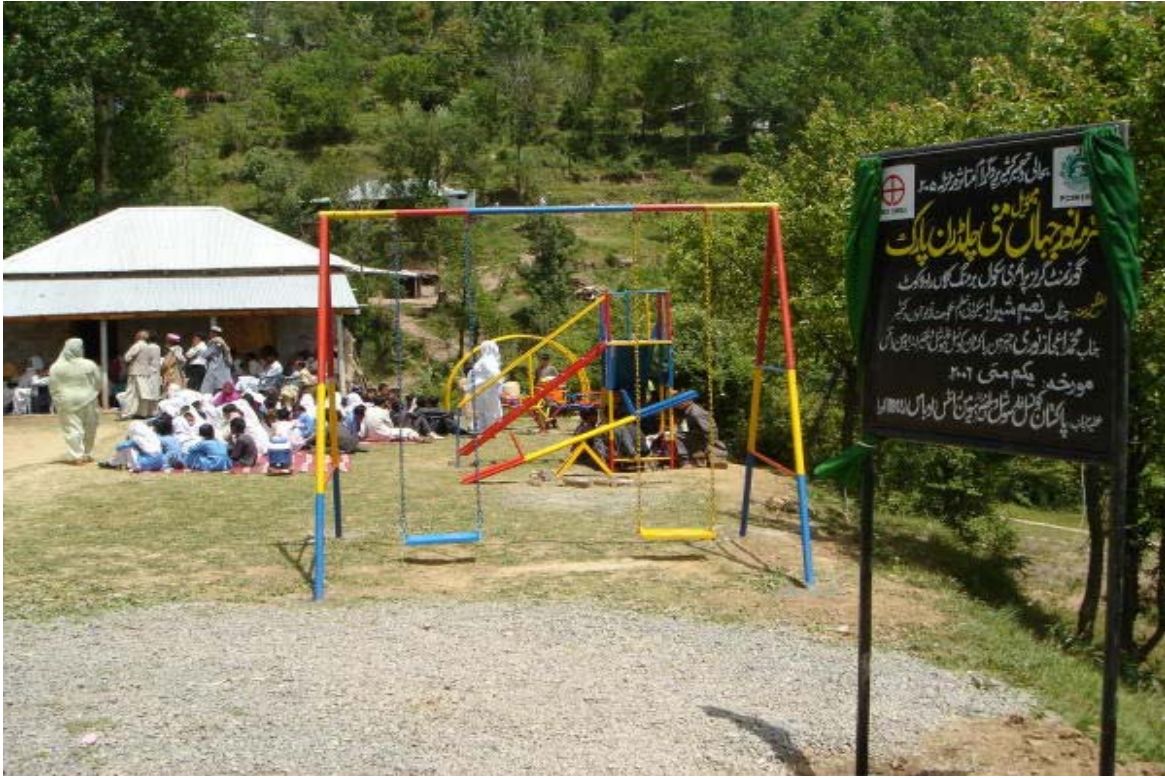
A View of Children Park established by PCSW&HR with the collaboration at Govt. Girls Primary School Bermong Rawalakot

PCSW&HR also established 2 mini children parks at Govt. Girls and Boys primary schools at village Bermong for children so that by providing these recreation facilities to the effected chidreln they me bring out traumatize situation.