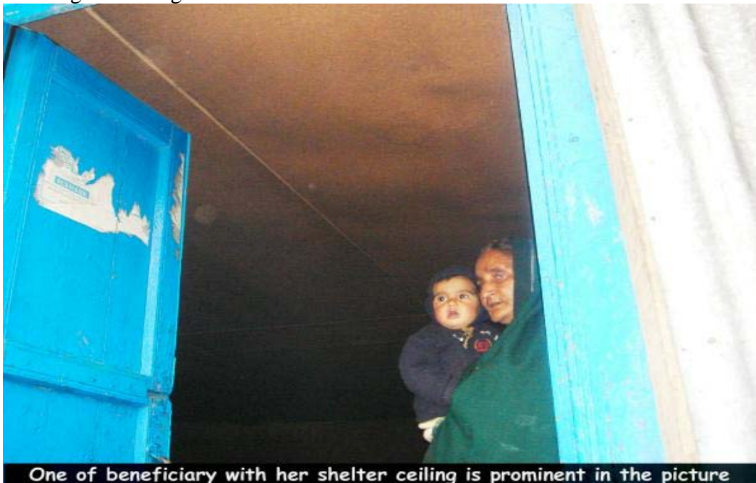
One of beneficiary with her shelter ceiling is prominent in the picture

PCSW&HR also provided permanent kitchen, latrines and ceilings to those 145 shelters built at Village Bermong Rawalakot.