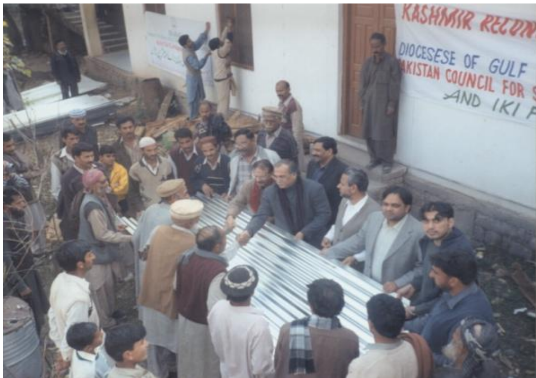
A view of distribution of CGI Sheets by PCSW&HR at Village Nakker Tehsil Dheer Kot

Pakistan Council for Social Welfare & Human Rights distributed 500 CGI sheets at village Nakker Tehsil Dheer Kot among the 30 families to build their permanent shelters using their available material remained save during the 8 th October 2005, with the Diocese of Gulf, Idra Khadmit-e-Insane (IKI).