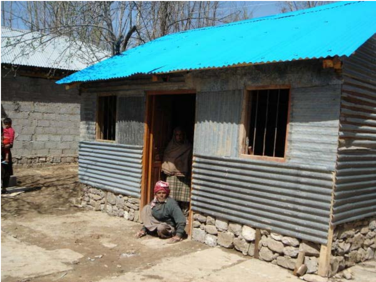
A View of Permanent Shelters built by PCSW&HR at Village Bermong Rawalakot AJK