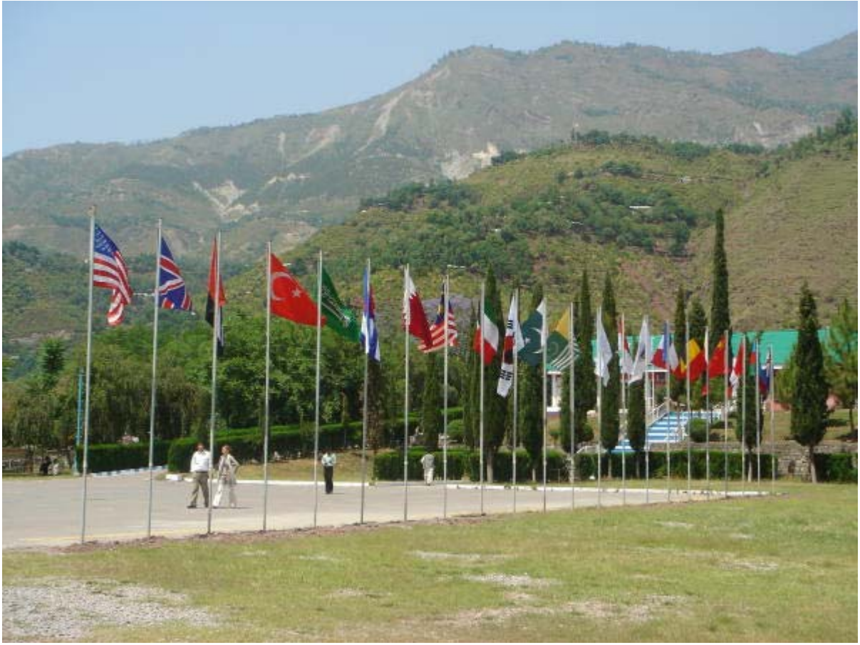
A view of Flags hosted by the Government of AJ&K of different prominent countries those actively worked in the rehabilitation and reconstruction process in AJ&K after earthquake 2005 during the humanitarian conference