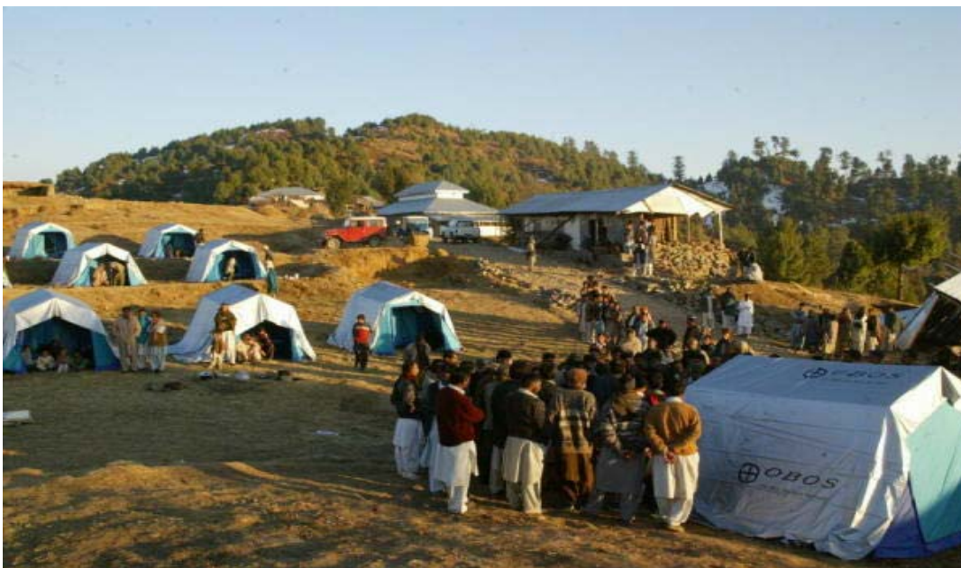
A view of Tent Village established by PCSW&HR at Village Sangoola