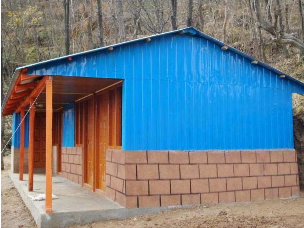
A View of Permanent Shelters built by PCSW&HR at Village Akhorban Rawalakot AJK

Recently PCSW&HR has completed another project Under this project 80 permanent shelters consisting 2 rooms size 12 x 12 feet, 1 kitchen size 11 x 7 feet with complete heating system, 1 bath room size 5 x 4 feet with all accessories and 1 veranda size 26 x 4 feet have been provided to those families of Village Akhorban Rawalakot 100 % lost their houses during the 8 th October 2005 earthquake.